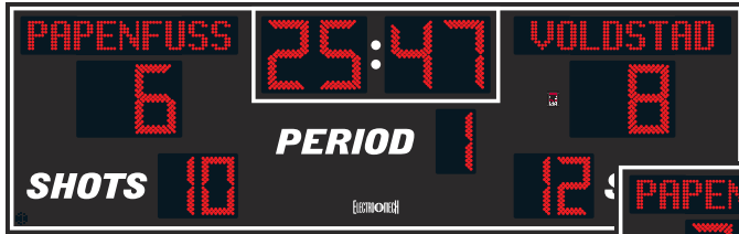
Reversible Captions for Soccer & Lacrosse or Football